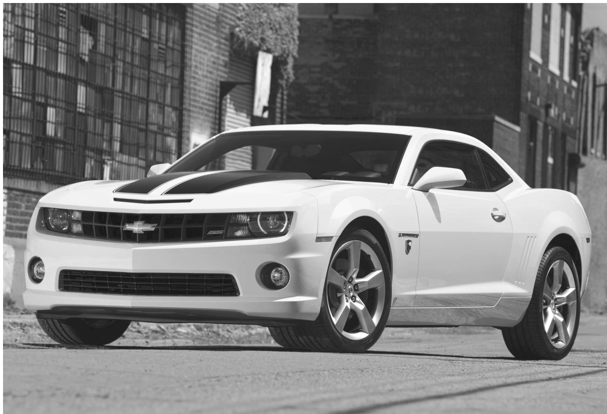
J.D. Power and Associates ranked the Chevrolet Camaro the industry's most dependable midsize sporty car and the Chevrolet Tahoe as the most dependable large crossover/SUV in its 2013 U.S. Vehicle Dependability Study, which covered the third year of ownership for 2010 models. In the Camaro's case, 2010 was its first year on the market.